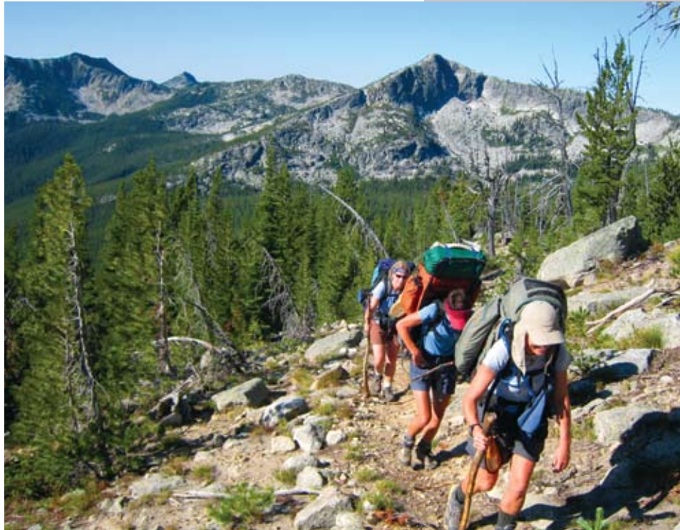
Long Canyon Loop, Selkirks

Idaho is big, so you'd think there would be plenty of room in the great outdoors.