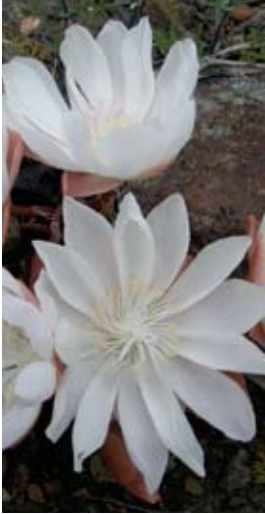
Bitterroot, Owyhee Wilderness