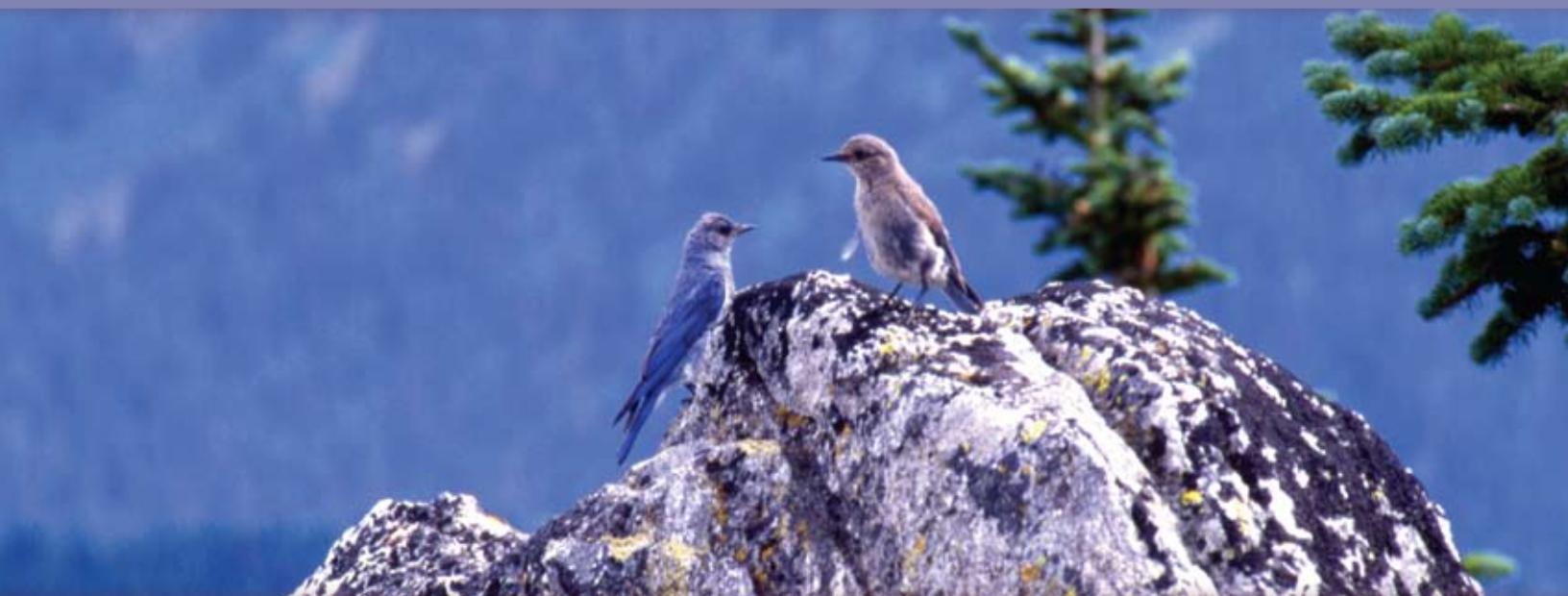
Mountain bluebirds, Clearwater National Forest

When you remember the Idaho Conservation League in your will, you make a lasting gift that protects Idaho's beautiful places for future generations. Leave a legacy by naming the Idaho Conservation League as a beneficiary in your estate!