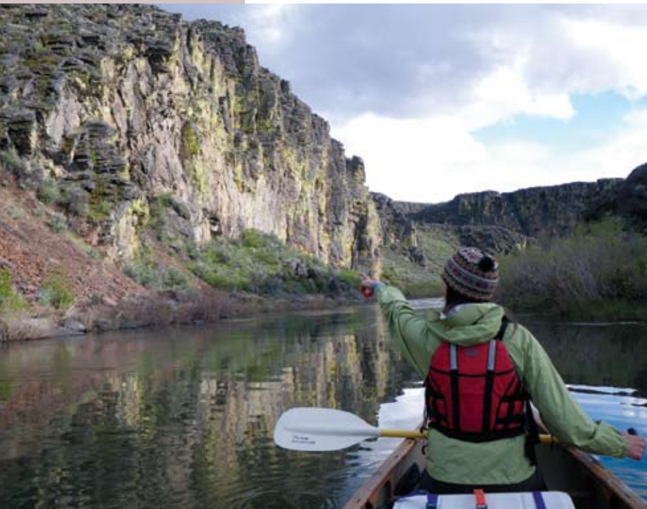
Owyhee Wilderness