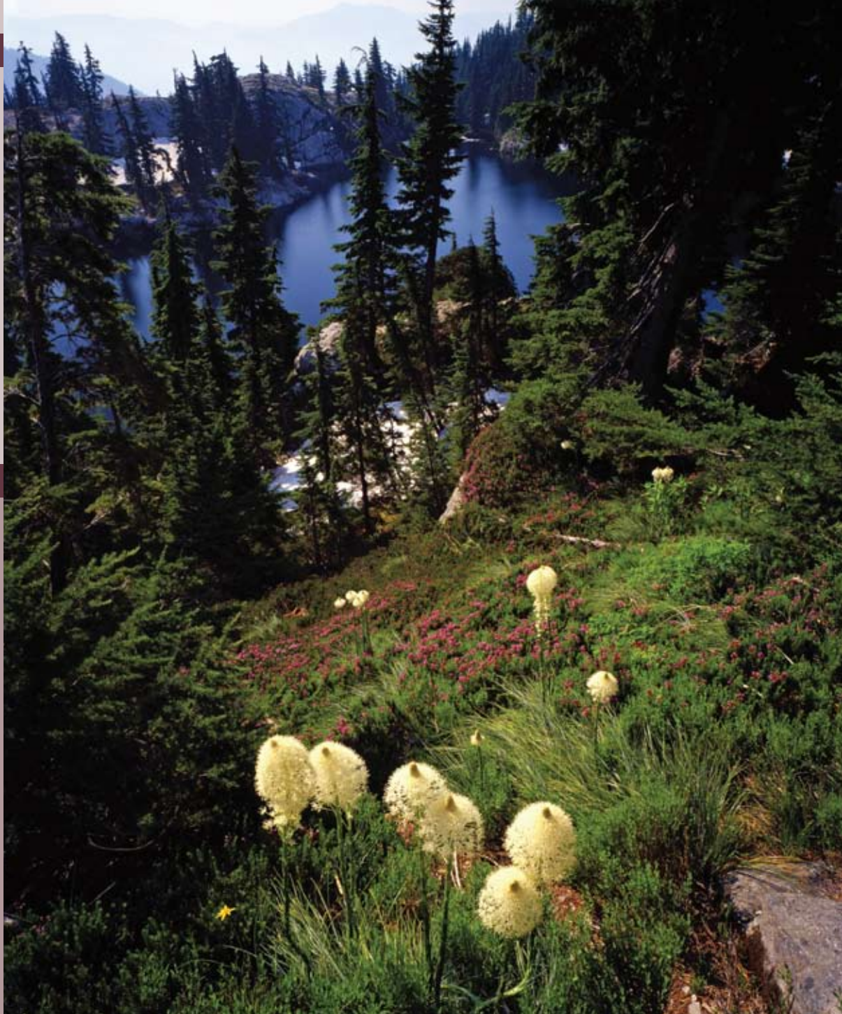
Black Lake, Mallard Larkins, Clearwater National Forest / Jay Krajic Cover photo: Clearwater National Forest / Jay Krajic The Idaho Conservation League is involved in the Clearwater Basin Collaborative to protect the exceptional features found there.

Because you love Idaho, the Idaho Conservation League preserves Idaho's clean water, wilderness and quality of life for future generations.