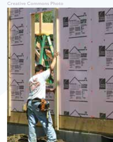
Insulation reduces power bills, makes homes more comfortable, and protects our air by reducing energy pollution. City officials can help citizens with a holistic conservation program.

Energy Associate botto@idahoconservation.org