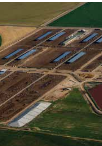
Magic Valley Dairy Operation