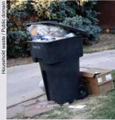
Household waste

This year, Ada County completed a study of the type of waste in its landfill. ICL had urged the county to do this study in the wake of a failed garbage-to-gas plant proposal by Dynamis. At that time, it was unclear how such an incineration facility would affect our air. Understanding what is in the landfill can inform future decisions impacting air quality and lay the groundwork for a more sustainable landfill.