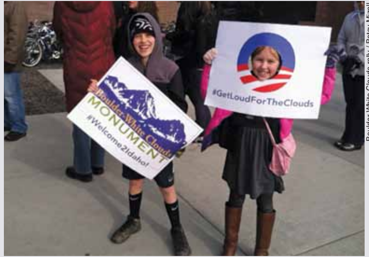
Boulder-White Clouds rally

Simpson has asked the Obama administration to postpone a monument designation for a few months as he tries to pass his latest bill. But a national monument