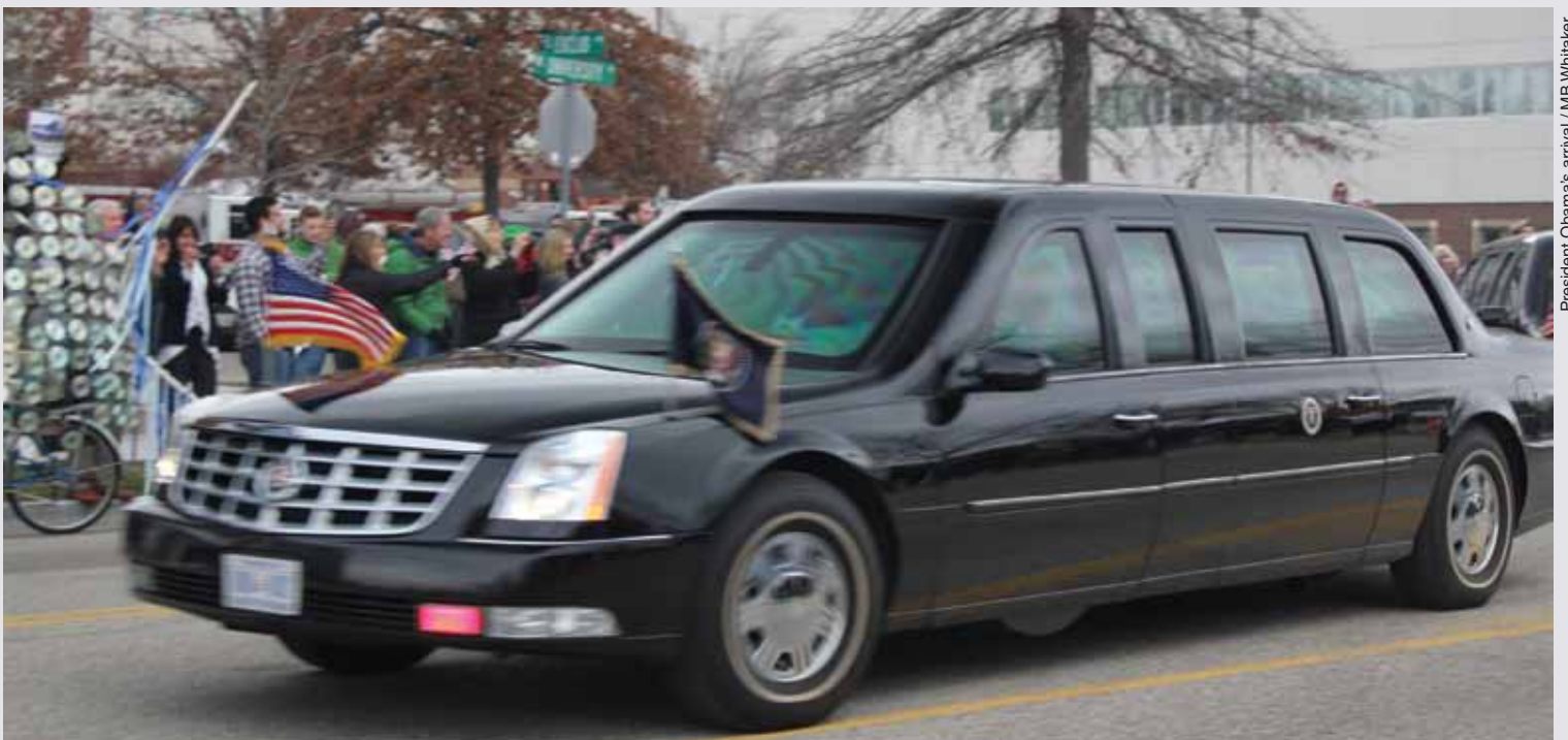
President Obama's arrival