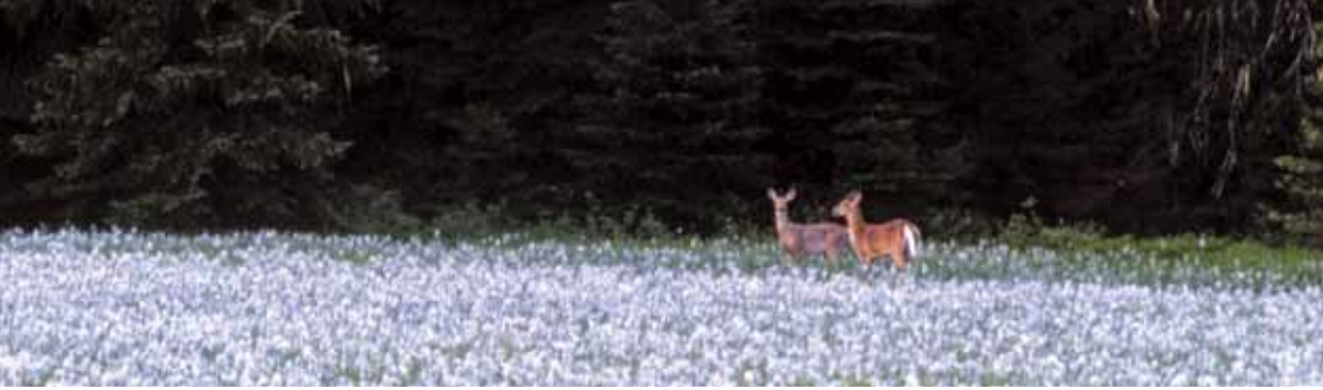
White-tailed deer in camas flowers