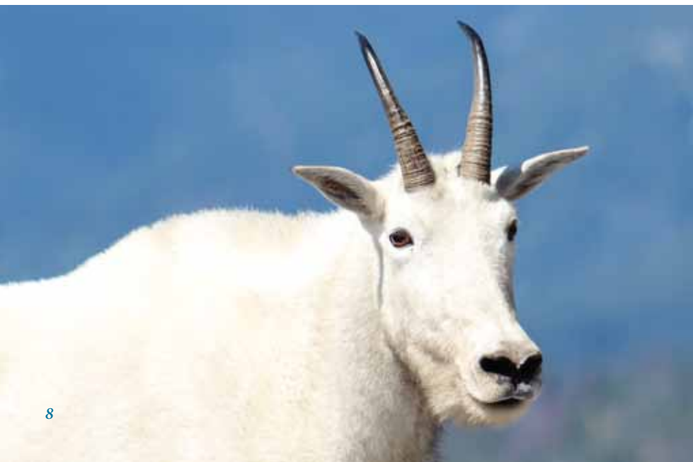
Mountain goat

The time has come for our congressional delegation to act. ICL is continuing to partner with the Friends to convince our elected officials to sponsor wilderness legislation for the area. You can become a friend at www.scotchmanpeaks.org . Their friendship is free to anyone who supports the cause.