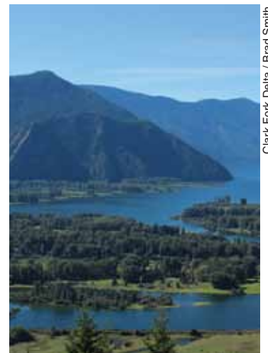
Clark Fork Delta