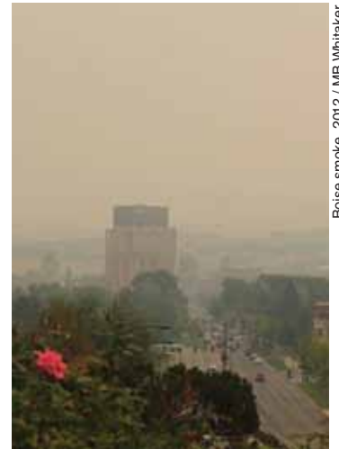
Boise smog, 2012