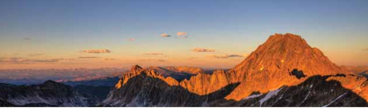
Boulder-White Clouds / Ed Cannady