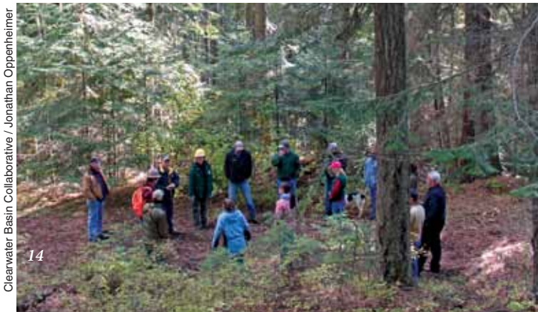
Clearwater Basin Collaborative / Jonathan Oppenheimer

The Clearwater Basin Collaborative gathers to hammer out collectively beneficial solutions.