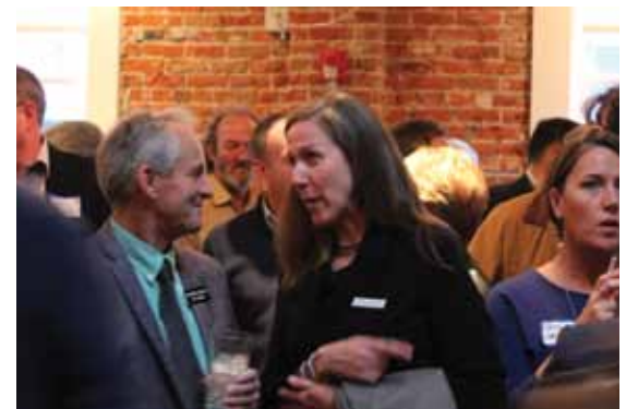
2016 legislative reception