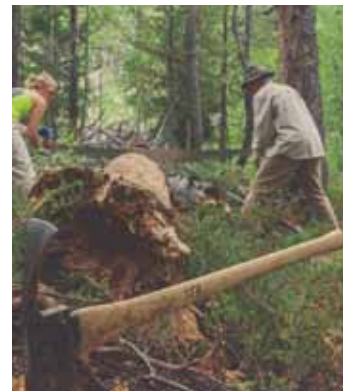
ICL staff doing trail work