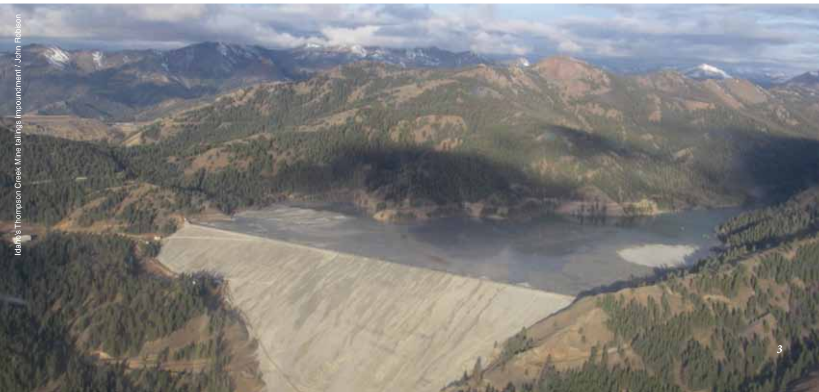
Idaho's Thompson Creek Mine tailings impoundment

The current bond for the Thompson Creek mine does not cover the costs of treating acid-mine drainage after closure. The new rule will help ensure that mining companies set aside sufficient cleanup funds before mining.