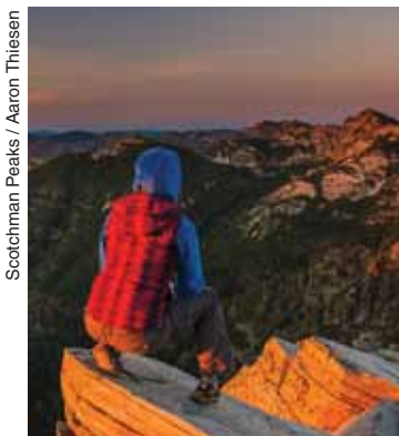
Scotchman Peaks

The Idaho State Snowmobile Association and other groups filed a lawsuit in federal court that seeks to overturn new land management plans for the Kootenai and Idaho Panhandle National Forests. They object to proposed wilderness boundaries delineated in the new plans and snowmobile prohibitions in these special areas.