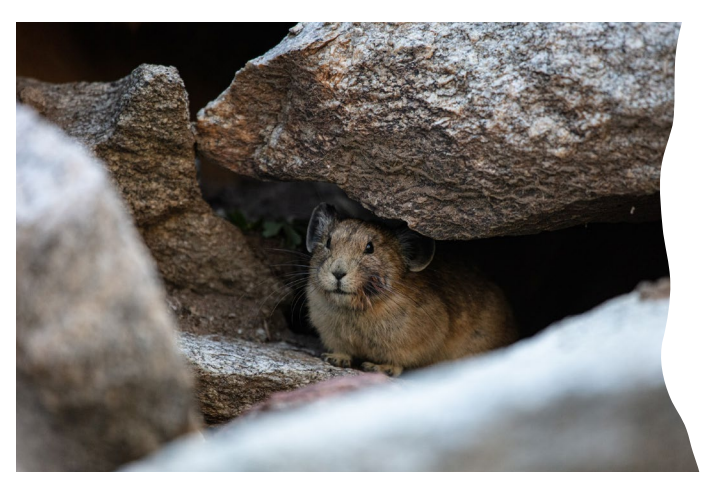
American pika are especially vulnerable to effects of climate change, as warmer temperatures result in loss of habitat.

Idaho has a rich hunting heritage and we do not see increased advocacy for non-game species as being in conflict with hunting or hunters. Indeed, ICL currently works well with many of the traditional hunting advocacy groups in Idaho. They are powerful advocates for their issues and have played important roles protecting and restoring habitat, which of course is important for both game and non-game species.