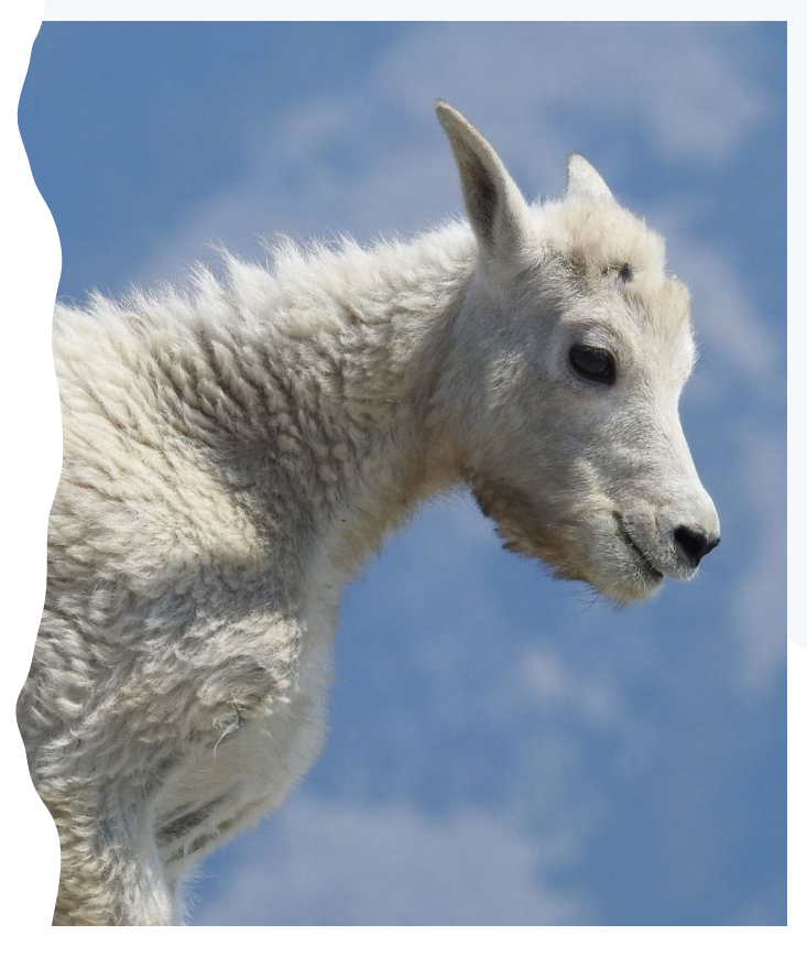
Mountain goat kid in the Scotchman Peaks.

But, in order to protect the full complement of wildlife in Idaho, to protect all of Idaho's biodiversity, we need to grow stronger advocacy for non-game species. We need to create and help direct funding to non-game species and ensure agencies do work in support of non-game species and the role that they play in the wild.