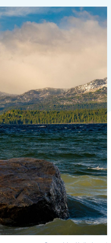
Cougar Island is the largest island on Payette Lake.