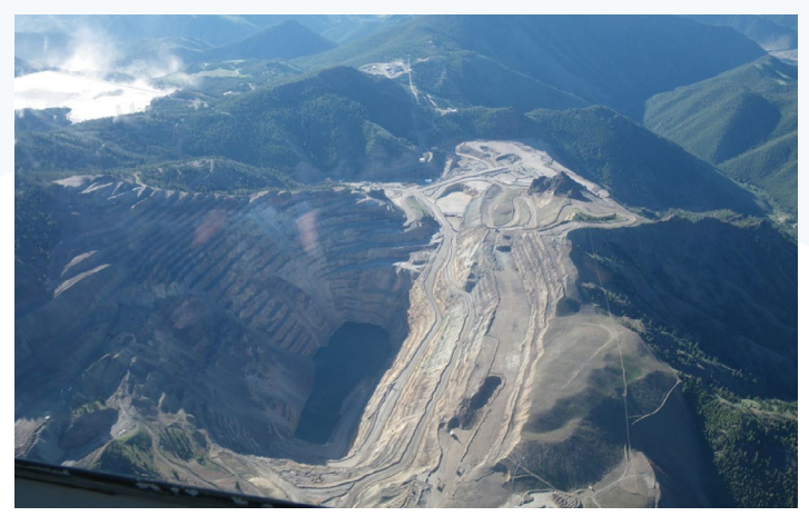
Rising dust from the Thompson Creek mine in 2016. The Stibnite Gold Project will also generate large amounts of dust and will involve three open pits instead of just one, photographed here.

The Forest Service recently released the Supplemental Draft Environmental Impact Statement (SDEIS) analyzing the controversial Stibnite Gold Project.