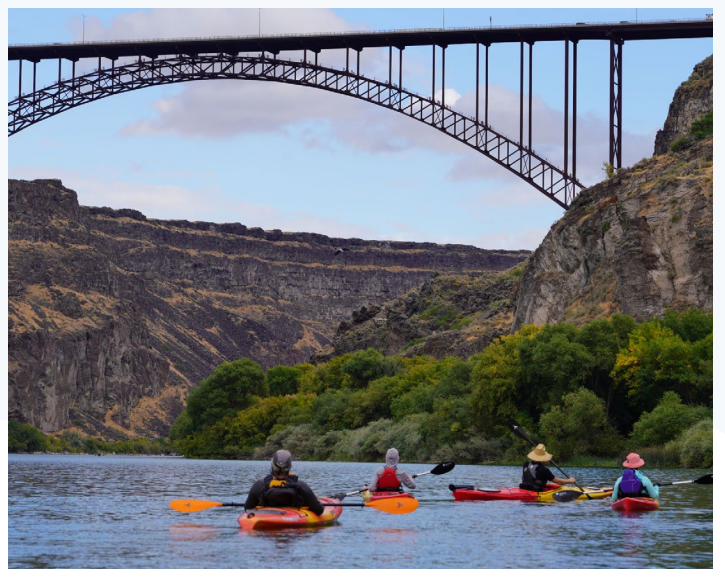
Kayakers on the Snake River in Twin Falls.

intended to assist the Department of Environmental Quality (DEQ) as it revises the Middle Snake phosphorus discharge limits. The plan is a Clean Water Act-mandated pollution "budget" that limits the amount of a pollutant (in this case, phosphorus) discharged into the river from both point sources (municipal wastewater treatment plants, fish farms) and nonpoint sources (runoff from agricultural fields).